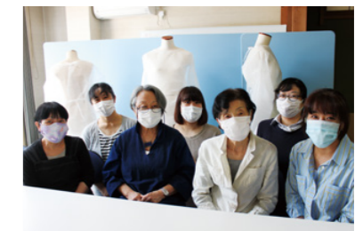
Through the personal network of our supplier, we also received support from a garment making vocational school in Nagano Prefecture. The teachers and students made 100 pieces of PPE from materials donated by a filter maker, one of Midori-kai member companies and donated them to the medical institutions in the region.