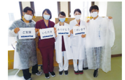
Members of donation recipient National Hospital Organization Osaka National Hospital

After medical experts inspected the protective ability and comfort of the prototypes, 10,100 gowns and 8,000 face shields were produced. We distributed them to medical institutions around the nation for free through the NPO Peace Winds Japan and the government, of which part was funded by donations from our employees. In addition to the isolation gowns and face shields, Komatsu and our employees are carrying out the following support activities: