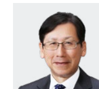
Standing Audit & Supervisory Board Member

4/1983 Joined the Company 6/2020 Took office as Standing Audit & Supervisory Board Member (current)