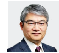
Standing Audit & Supervisory Board Member