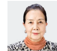
Outside Audit & Supervisory Board Member

4/1984 Joined the Company 6/2021 Took office as Standing Audit & Supervisory Board Member (current)