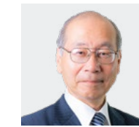
Outside Audit & Supervisory Board Member

4/1993 Took office as Professor at Ochanomizu University 4/2008 Took office as Professor Emeritus at Ochanomizu University (current) 6/2015 Took office as Audit & Supervisory Board Member of the Company (current)