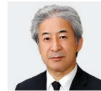
Director and Senior Executive Officer