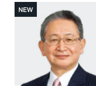
Outside Audit & Supervisory Board Member

4/1976 Appointed as Prosecutor 7/2009 Took office as Vice-Minister of Justice 7/2012 Took office as Superintending Prosecutor of Tokyo High Public Prosecutors Office 7/2014 Took office as Prosecutor-General of Supreme Public Prosecutors Office 9/2016 Retired from the position of Prosecutor-General of Supreme Public Prosecutors Office 11/2016 Attorney at law, Special Counsel of Mori Hamada & Matsumoto (current) 6/2017 Took office as Audit & Supervisory Board Member of the Company (current)