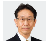
President and CEO Representative Director

4/1982 Joined the Ministry of Foreign Affairs (hereinafter "MOFA") 7/2014 Took office as Director-General, Economic Affairs Bureau and Councillor, Cabinet Secretariat 10/2015 Took office as Director-General, International Legal Affairs Bureau 7/2017 Took office as Director-General, Foreign Service Training Institute, MOFA 1/2019 Retired from MOFA 4/2020 Took office as Visiting Professor, Graduate School of Public Policy, The University of Tokyo 6/2021 Took office as Director of the Company (current)