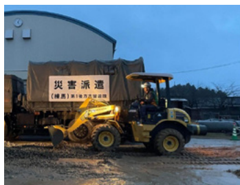
Clearing the elementary school grounds at the evacuation center to make it easier to walk.

Since the collection and disposal of disaster debris is currently an issue in the affected areas, we will continue to provide free-of-charge loans of vehicles and other equipment that match these needs.