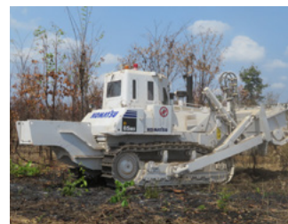
(left) Demining machine "D85MS-15"

In areas afflicted by anti-personnel landmines, Komatsu has engaged in activities to support community development in work ranging from demining to reconstruction. Komatsu developed demining machines and construction equipment by combining technical expertise and knowledge in manufacturing. Komatsu began this project in Cambodia in 2008, partnering with the authorized NPO Japan Mine Action Service (JMAS). This activity is still ongoing.