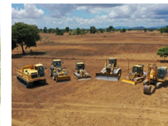
(right) Construction equipment loaned free of charge as part of agricultural CSR activities

Web Received the 21st Corporate Philanthropy Award.