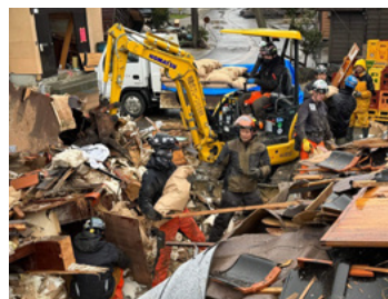
Removing debris to rebuild a damaged sake brewery