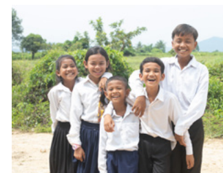
(middle) Students who attend an elementary school donated by Komatsu