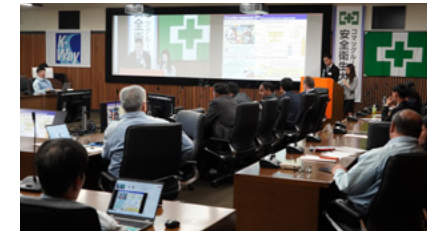
Presentation of good practices at the Komatsu Group safety and health convention (At the Komatsu Way Global Institute)

The Komatsu Group promotes occupational safety and health activities, such as risk assessments, to prevent work-related injuries and ensure the horizontal deployment of measures to prevent the reoccurrence of previous incidents. In addition, we hold the Komatsu Group safety and health convention, through which activities in each region are reported and best practices are shared to enhance safe workplace environments.