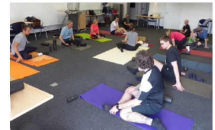
Health promotion events for employees (Germany)

In Japan, Komatsu upholds the mid-term health promotion plan and works to improve employee health awareness. This plan enables employees to gather the necessary information to lead healthier lives. We announced the Komatsu health declaration, which provides useful information for employees to improve their health through apps and other methods. In addition, we hold various events for employees, including walking events, weight measurement events and other activities to promote healthy habits. We also make efforts to understand the situation of group companies outside of Japan with different medical conditions, striving to share information with such companies.