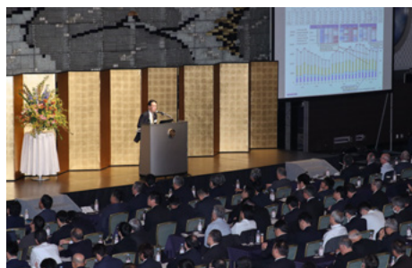
Komatsu Midori-Kai executive meeting

Every November, Komatsu and Midori-kai companies (major suppliers) hold the Komatsu Midori-kai executive meeting. There, Komatsu executives and top management of Midori-kai companies get together with the aim of promoting mutual growth between Komatsu and Midori-kai companies. In 2023, a total of 550 people participated in the meeting, including 459 Midori-kai members from 227 companies, Komatsu Group participants and Midori-kai members outside of Japan who joined the meeting for the first time in four years. Komatsu's procurement strategy is characterized by a high level of trust built through longstanding partnerships with the companies. At this year's meeting, Komatsu shared information (global procurement policy, requests to Midori-kai, first half business results, progress in the mid-term management plan, etc.) and encouraged a lively discussion on the possibilities for business expansion for each company.