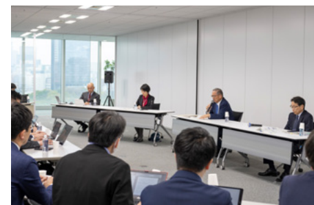
Dialogue between the Outside Director and investors